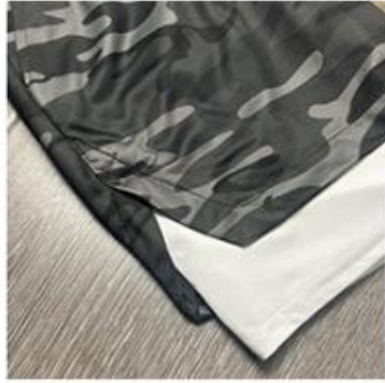
SLIT FOOT OPENING