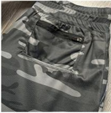
ZIPPER BACK POCKET