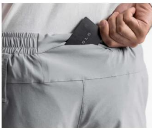
Pocket in the back