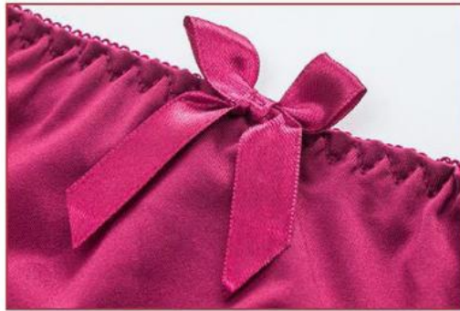
BUTTERFLY ELASTIC WAISTBAND