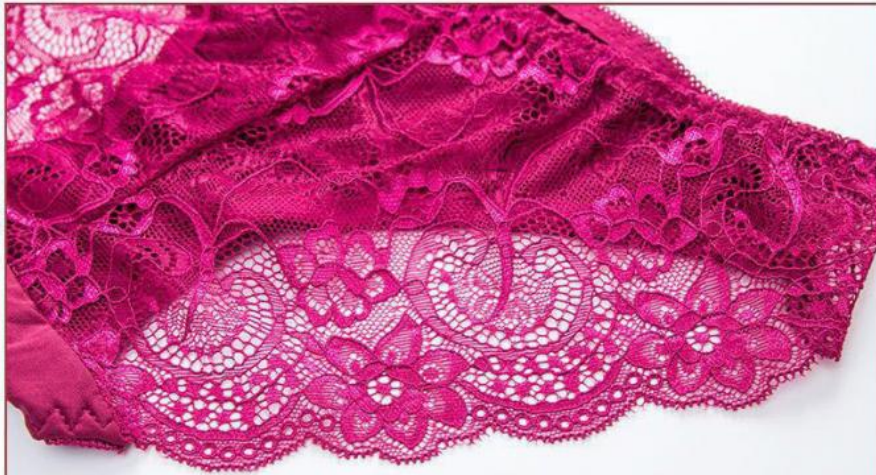
LACE TRANSPARENT DESIGN