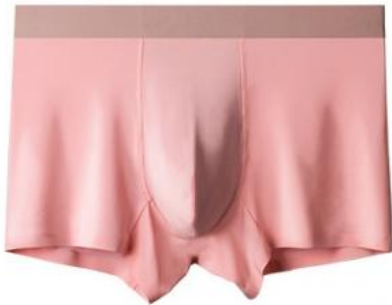
MARCA DRAGON POWDER