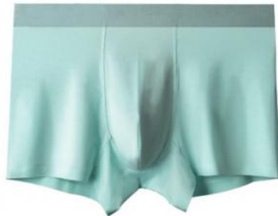
THE OCEAN BLUE