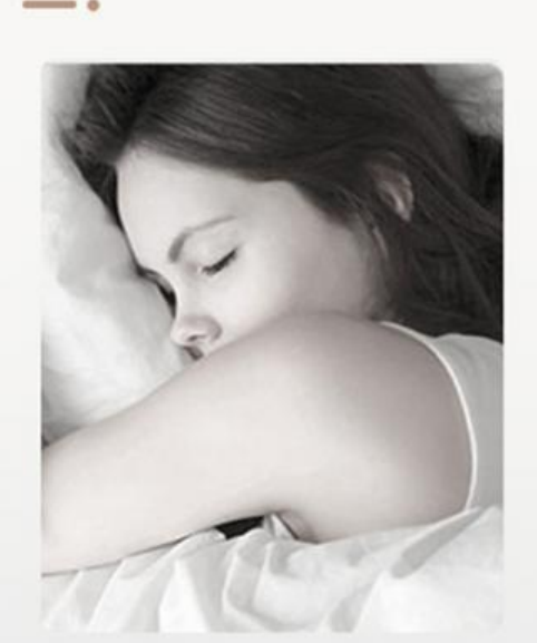
SLEEP LEAK SHEETS SOILED

The embarrassment of dirty clothes and bad mood.