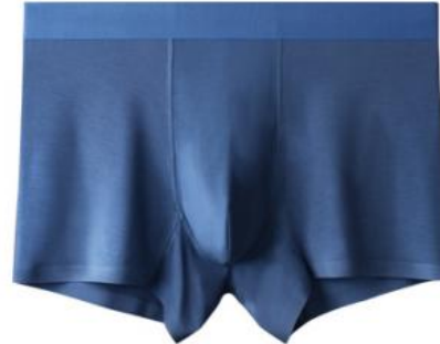
IN THE LAN